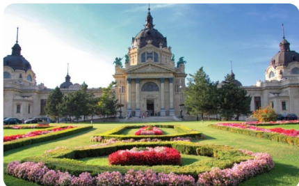
Széchenyi Thermal Baths

Beyond academics, Hungary offers an incredible cultural experience. From world-famous thermal baths to stunning architecture and delicious cuisine, here are the must-experience highlights: